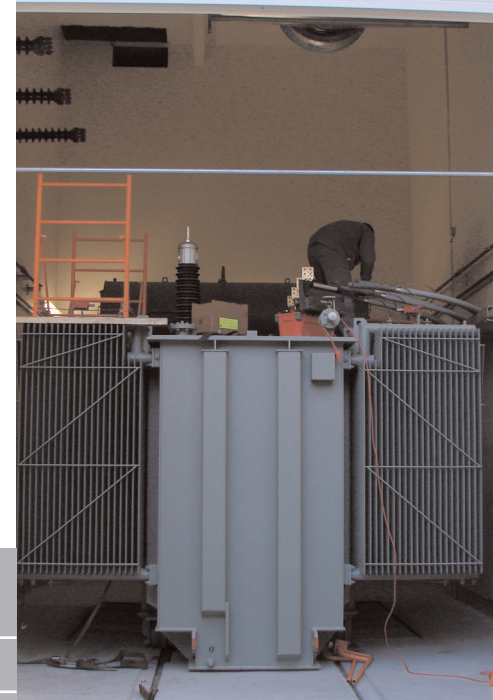
Installation, in the densely populated urban areas of Grenoble, of Pauwels fluid-filled 36 MVA transformer, using a hybrid insulation system based on DuPont™ Nomex® thermal technology.

Transformers insulated with tried-and-tested DuPont™ Nomex® thermal technology are smaller and lighter for a given power rating than most conventionally insulated units, take load variations and overloads in their stride, operate safely and reliably with winding temperature rises of more than 65 K.